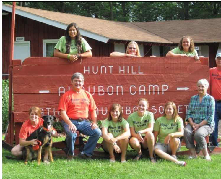
Need new staff photo here