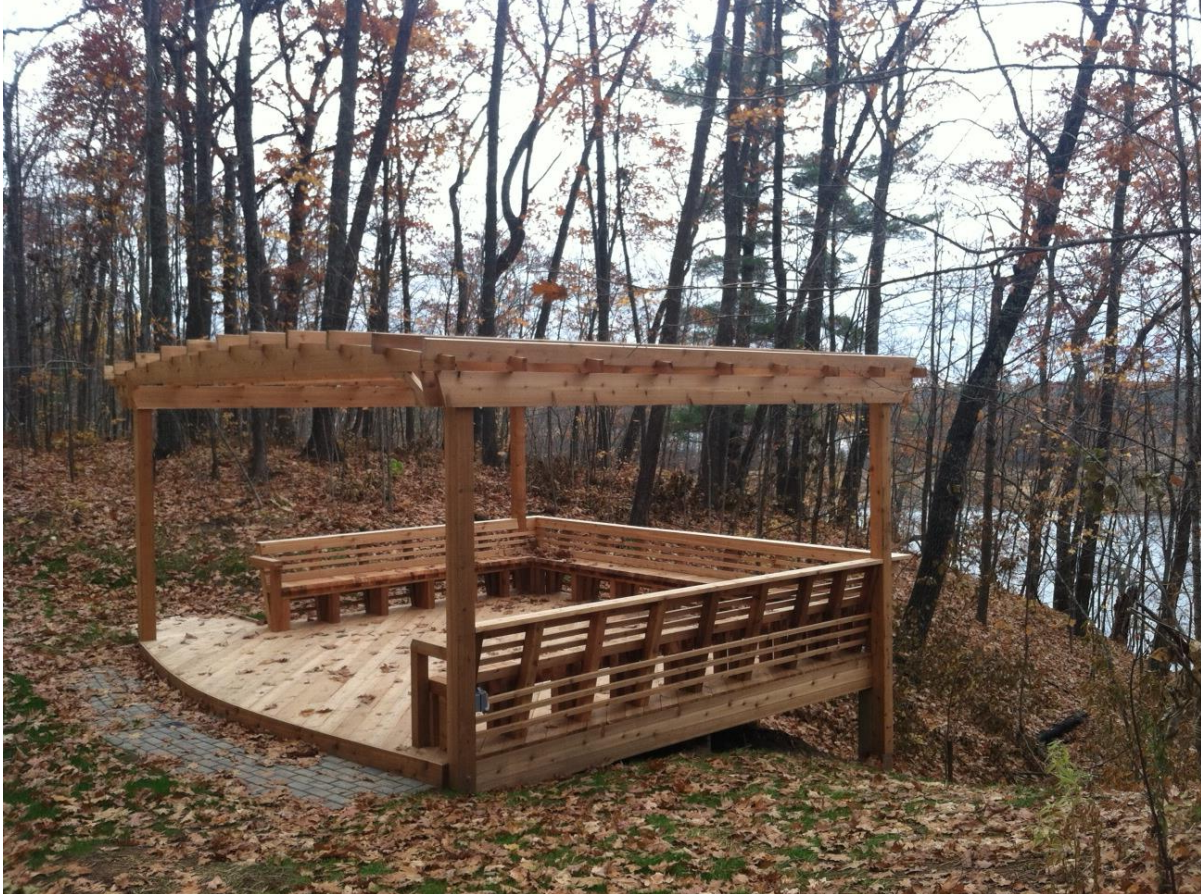
New Amphitheater Cedar Deck with Pergola (located between Cross Dorm and Square Dorm)

Hunt Hill Audubon Sanctuary N2384 Hunt Hill Rd Sarona, WI 54870 (715) 635-6543