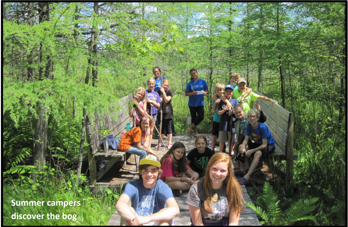
Summer campers discover the bog