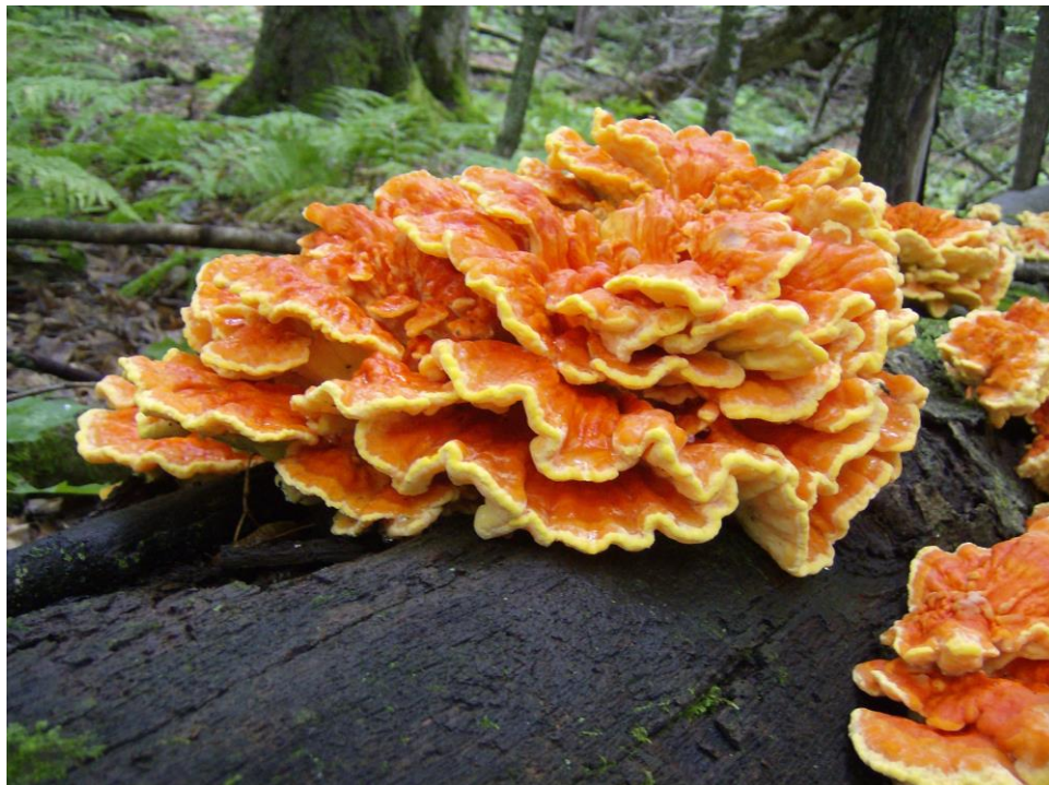
Chicken Polypore mushroom found at Hunt Hill August 2007

The Friends of Hunt Hill Audubon Sanctuary, Inc. N2384 Hunt Hill Rd Sarona, WI 54870 (715) 635-6543