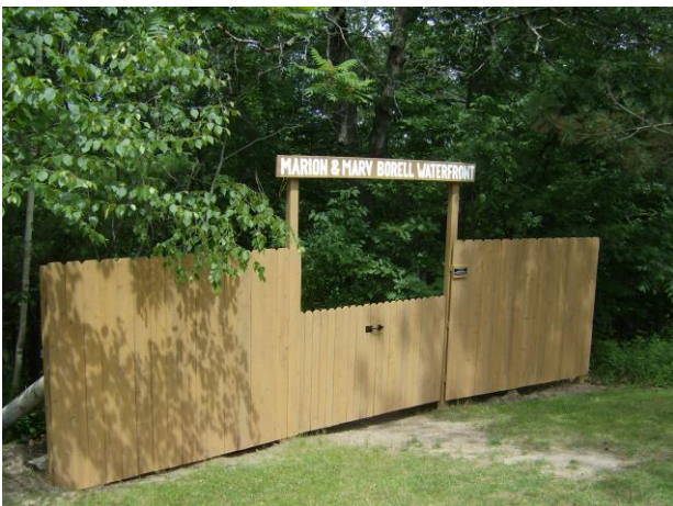
Borell Gate going down to the waterfront