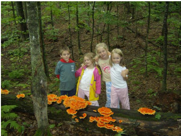
Day Campers in August

Donations to Endowment Fund in 2007 totaled $10. Donations in 2006 totaled $250. Total endowment value as of 8/21/07 is $17,708.13.